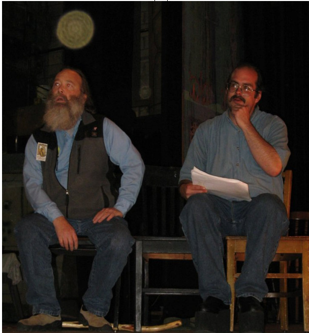
An "Orb" that mysteriously materialized during a photo shoot rehearsal of FRANKENSTEIN at the historic Egyptian Theatre. For more on this story, visit the OBT website: www.onbroadwaytheater.com/page10.html

One specific ghost, THESPIS , holds a place of privilege in theater lore. On what has been estimated to be November 23, 534 BCE, Thespis of ancient Athens (6th BCE) is thought to have been the first person to speak lines as an individual actor on stage ( hence the term "thespian" to refer to an individual actor ). Any unexplainable mischief that befalls a production is likely to be blamed on Thespis, especially if it happens to occur on or around November 23rd.